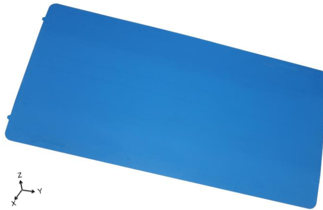
The A5530 Ground Mat